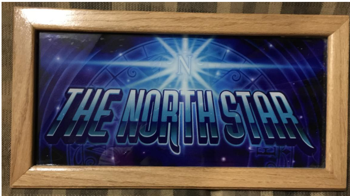
Oak Frame with No Stain