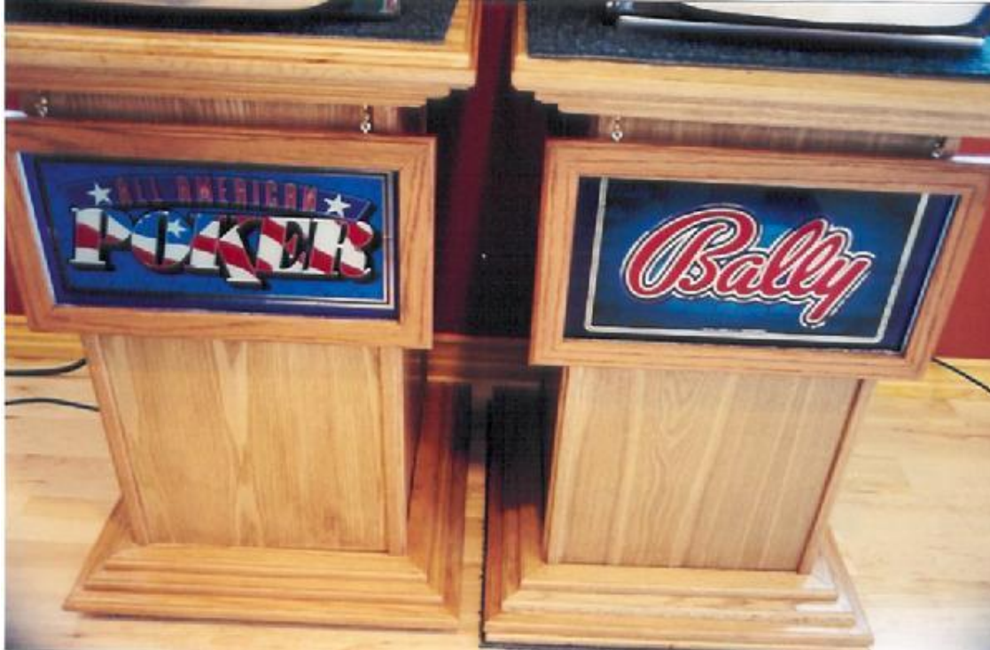
Stands With Frames Related to Each Game