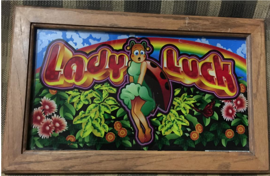
Oak Frame with Light Stain