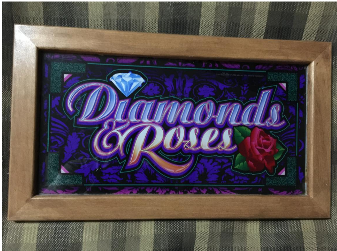
Maple Frame with No Stain